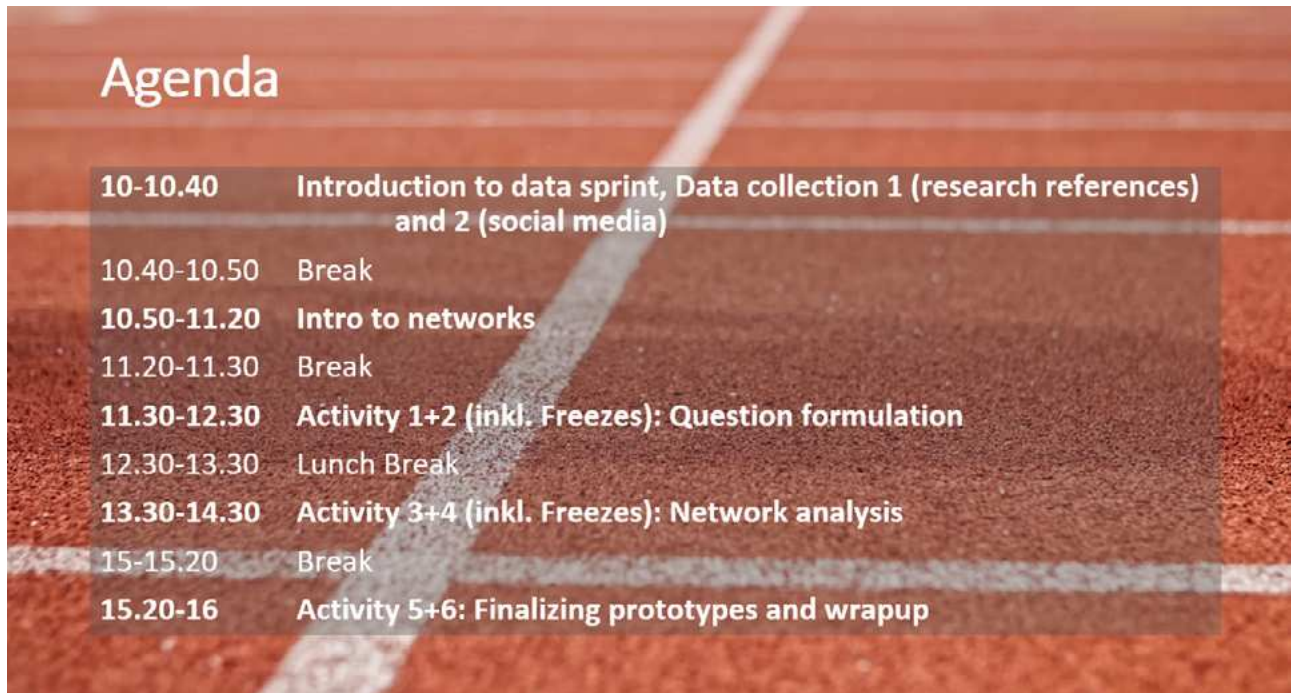
Figure 1. Structure of the data sprint (as shown to participants, original slide deck)

made use of the “sprint” metaphor (with both the background and the “freezes”). The exact time slots were adopted during the sprint.