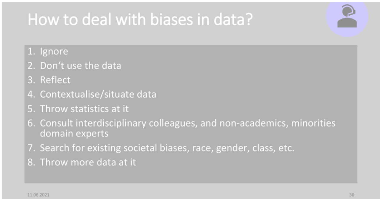
Figure 3. Suggestions for how to deal with biases in data.

the data sets by themselves: some decided to take out “big” nodes in their Gephi visualisations to see how that would change the relations between other nodes – accounting for making hierarchies in data appear in a different light. Others suggested it needed more data to make their initial findings more sound, or one suggested that it needed domain experts to interpret the data they had visualised.